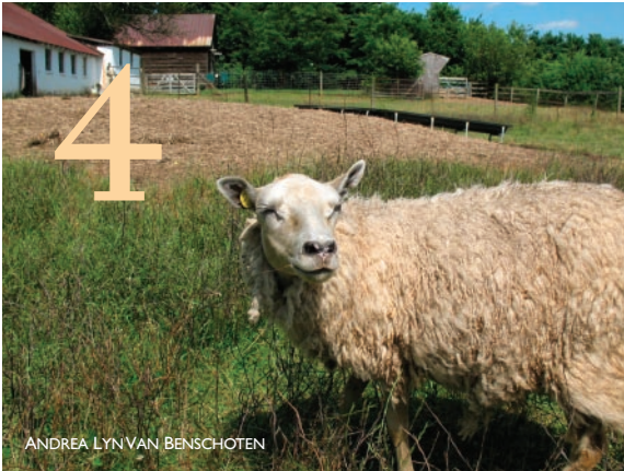
ANDREA LYN VAN BENSCHOTEN

purchase a support spindle and check out the latest new wheels on the market.